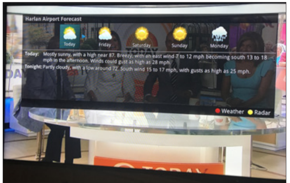
Customers can view the 5 day forecast by pushing the GREEN button on the remote.