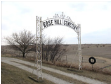
Brush and trees will be removed and the barbed wire fencing will be replaced with a new white fence as funds are raised.

It has served generations of families over the span of its 123 years. Today, it is an irreplaceable part of the Kirkman community. It is a place of history and honor for, to date, over 640 loved ones including 51 veterans (5 Civil