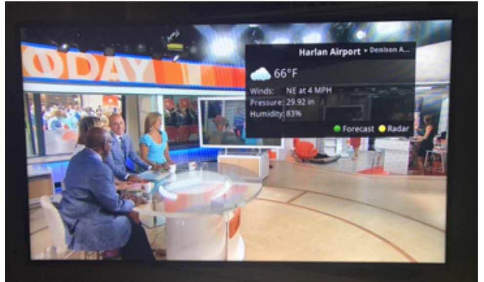
Customers can view the current conditions window by pushing the RED button on the remote. Customers can choose information for the Harlan or Denison area.

Call us at 744-3131 to get Digital TV with FREE HD and Whole Home DVR and this great local weather feature.